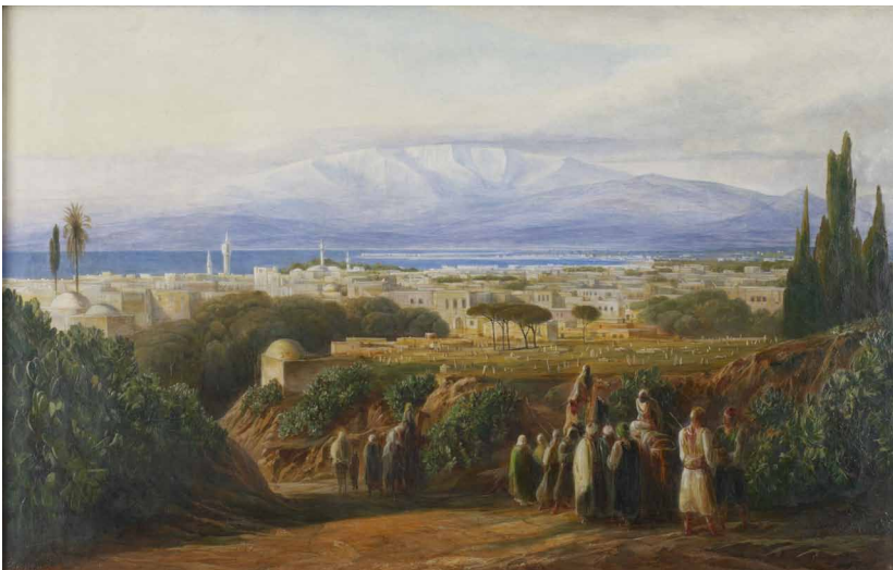
Edward Lear View of Beirut c.1861, Oil on canvas, © Crown copyright: UK Government Art Collection

The works in this exhibition all relate to some kind of travel; some reference the act of physically going somewhere, for example, the maps or the paintings of places visited by the artist. Others suggest travel through time using the memory or the imagination or even travel inside the artists mind.