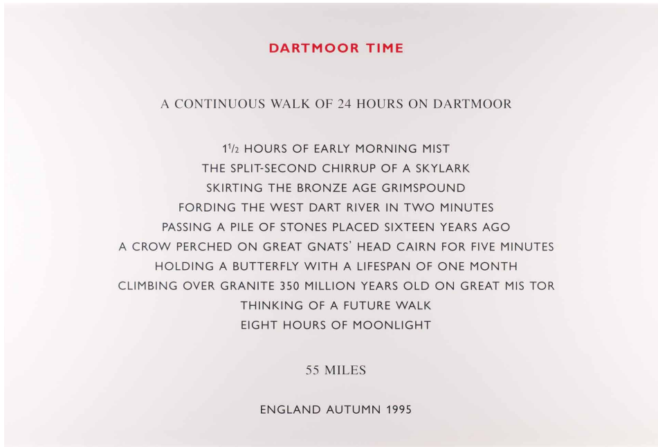
Richard Long Dartmoor Time 1996, Medium Printed text on paper.

Look at the text piece by Richard Long high on the right hand wall. He describes a walk he took on Dartmoor. During the walk he has thought about the past and the future.