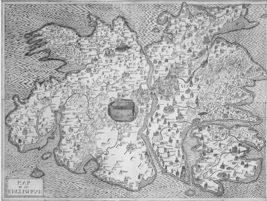
Grayson Perry Map of an Englishman 2004, Etching on four plates

In Grayson Perry's etching Map of an Englishman , he has tried to map his own mind dividing it into three imaginary islands.