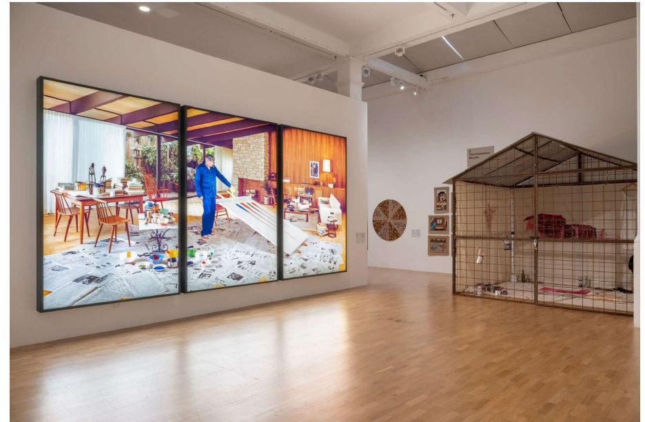
Gallery 1 installation view of A Century of the Artist's Studio: 1920-2020 , 24 February–5 June 2022.

By choosing the Whitechapel Gallery for your event you are directly supporting the internationally-recognised work of the Gallery and helping us to enrich the lives of more people through access to contemporary art.