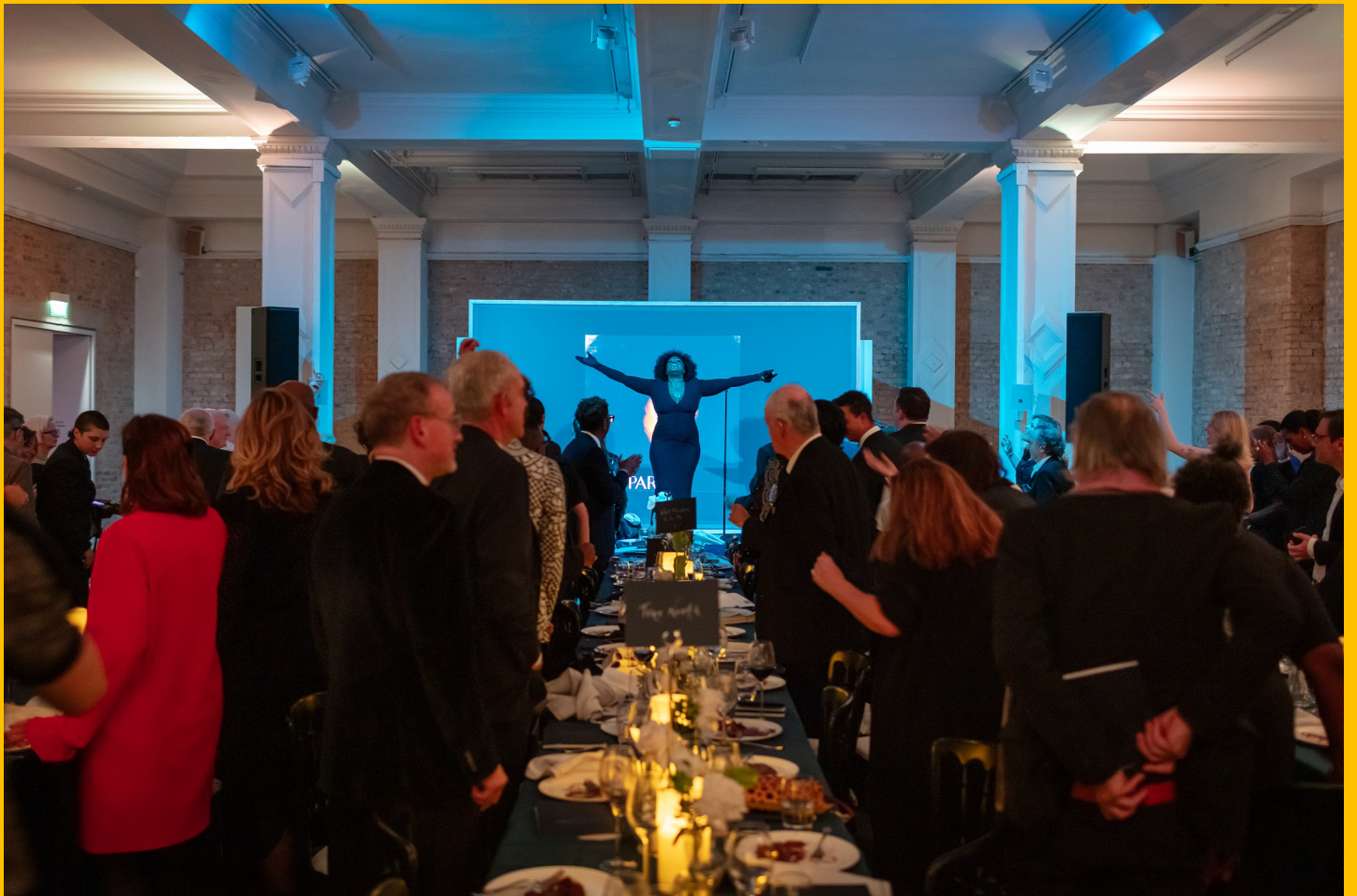
Art Icon 2024 in the Assembly Room .